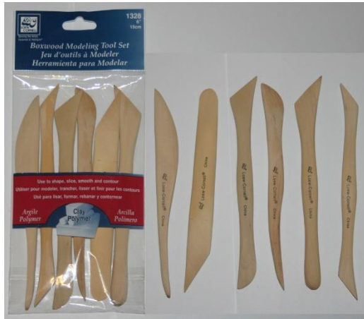
Basic Wooden 6 inch long Modeling Tool set