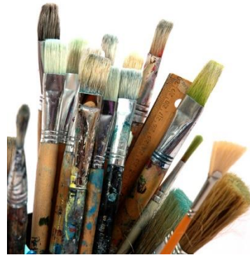
Optional: Couple brushes