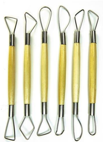
Optional: Basic Loop Tool set

Optional = Good to have but not necessary