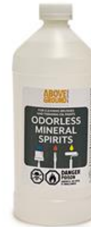
Optional: Odorless Mineral Spirit