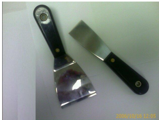
1 Metal Scraper