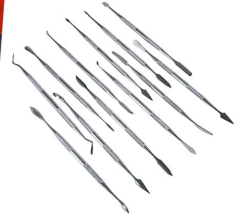
Optional: Metal Spatula set